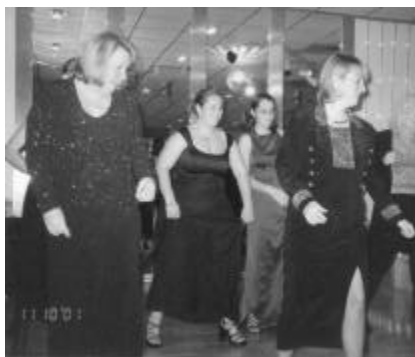
Electric Slide...Achy Breaky Heart...you name it, they danced it!